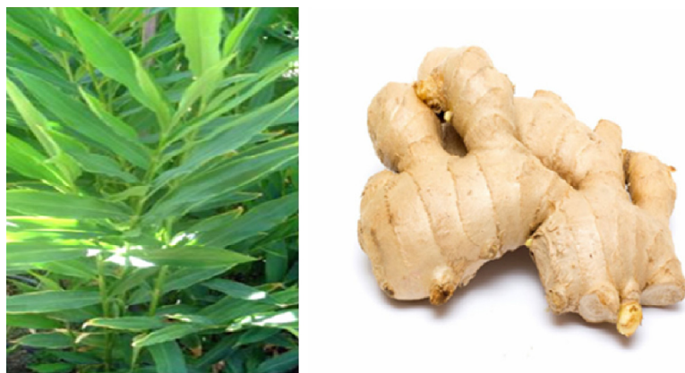
Figure 1: Ginger plant and rhizome

12.3% carbohydrates. The minerals present in ginger are iron, calcium and phosphorous. It also contains vitamins such as thiamine, riboflavin, niacin and vitamin C. The composition varies with the type, variety, agronomic conditions, curing methods, drying and storage conditions. [6]